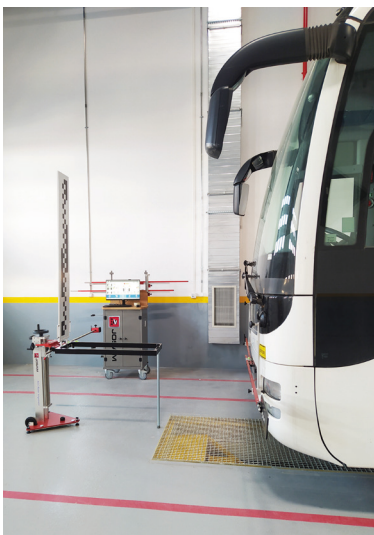
Camera calibration on bus

The calibration of advanced driver assistance systems (ADAS) is essential for maintaining vehicle safety and performance. Our static ADAS calibration system offers significant safety advantages by ensuring precise alignment and correct functionality of active safety sensors, without the need for on-road calibration.