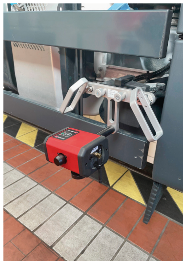
Side radar calibration