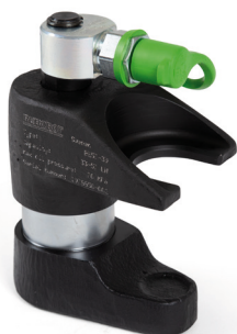
Art. no. I-BE57-39/10949

For use with either an air-driven or hand pump.