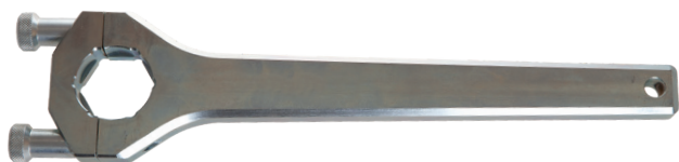
Art. no. 2MB-KEY/15071

Tool for loosening the tie rod (toe adjustment) and drag link.