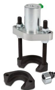
Art. no. I-BEU110/21025

For use with either an air-driven or hand pump.