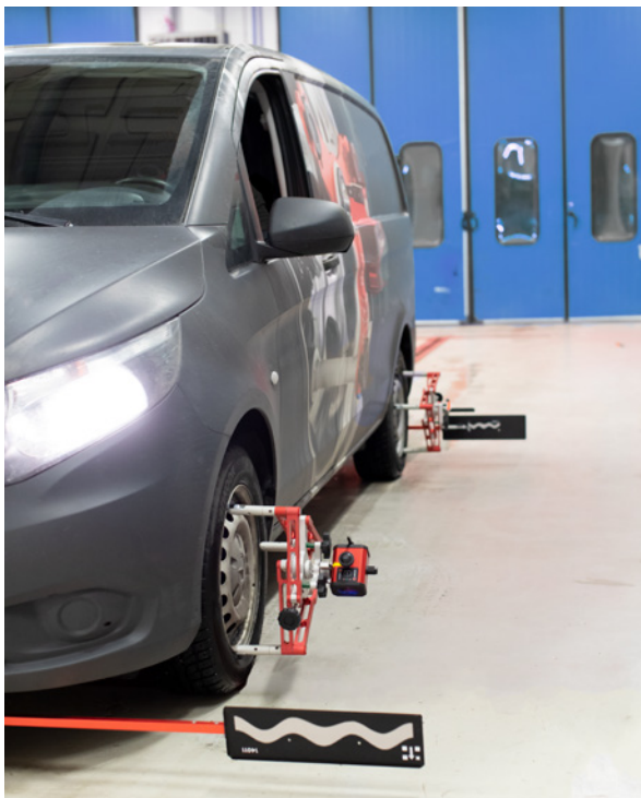
Van measured with multi-roll