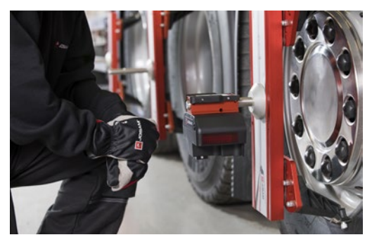
I-track II classic