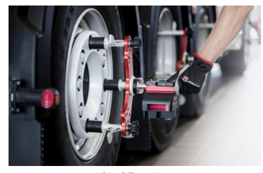
I-track II premium